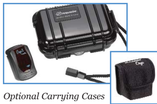
Optional Carrying Cases

Please contact your authorized distributor for more information.