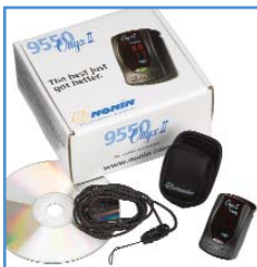
Standard Package Items